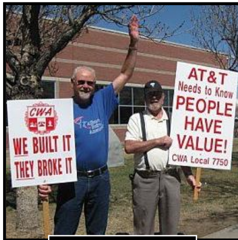
Denver retiree rally

If AT&T thinks we're going to leave the retirees in the company's hands, they've got another thing coming.