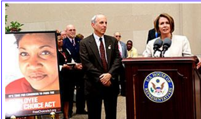
At the Rayburn House Office building, "Best House Speaker Ever" Nancy Pelosi tells CWAers that "we will win real health care reform."

Secretary of Labor Hilda Solis reaffirmed President Obama's support for the Employee Free Choice Act, stressing that the administration believes 100 percent that "in order to rebuild the middle class, we need to restore fairness and that's why we need the Employee Free Choice Act."