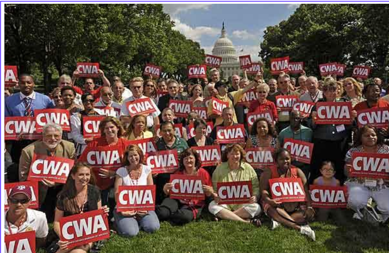
CWAers converge on Capitol Hill. CWA members scheduled more than 200 meetings on Capitol Hill with their senators and representatives and staff.

CWA's biggest Lobby Day ever was a huge success.