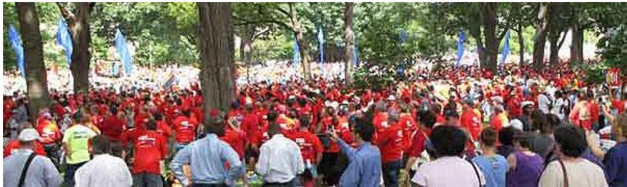
More than 1,000 CWAers rally for Health Care for All NOW.

Following the rally, everyone followed Senator Schumer's advice and took that energy to Capitol Hill for meetings with their representatives and senators.